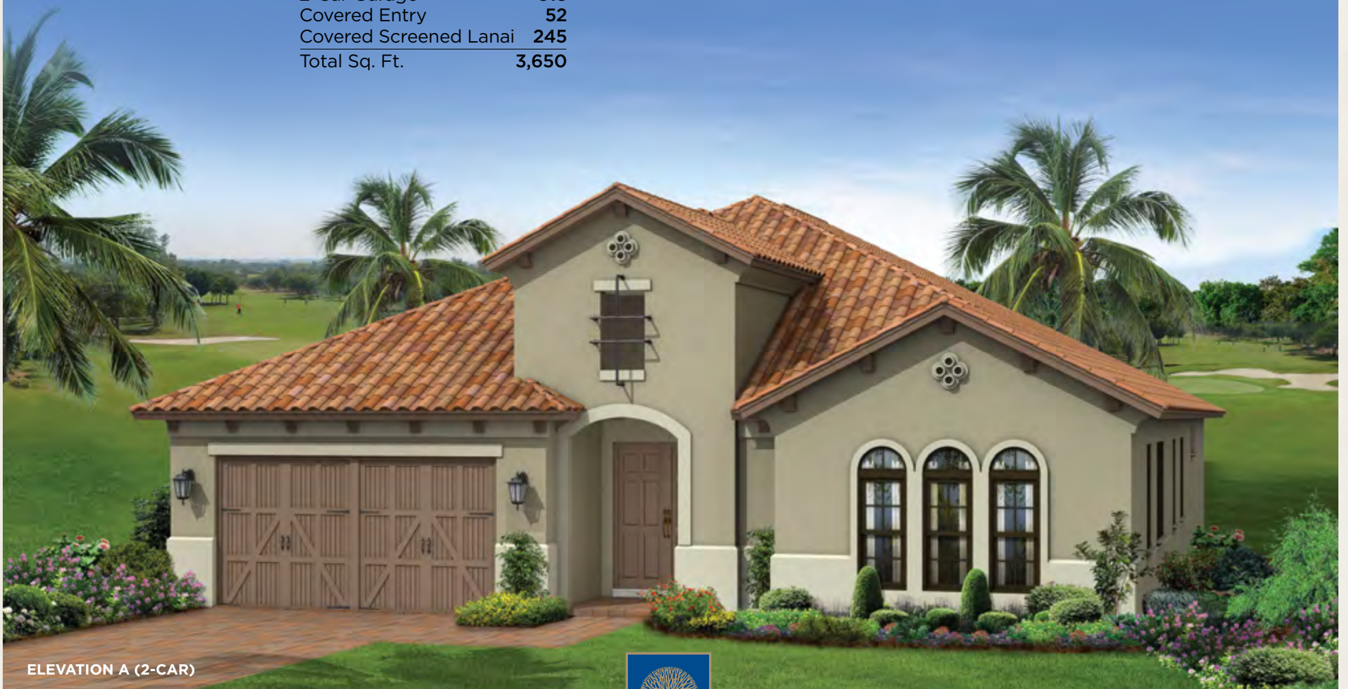
ELEVATION A (2-CAR)

Front elevation window configurations change per elevation chosen