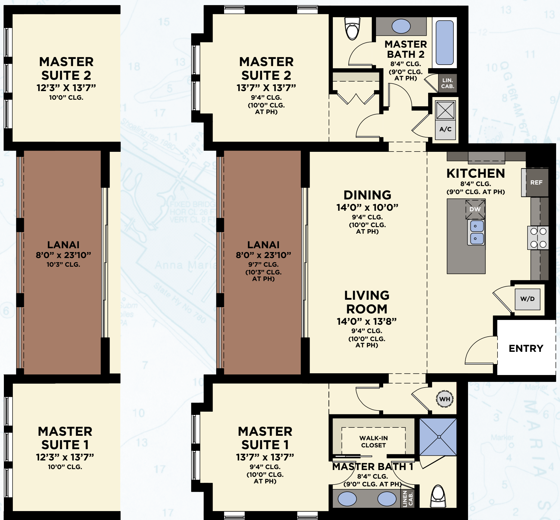
PENTHOUSE WINDOW VARIATION