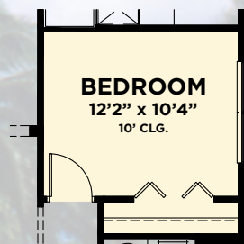
AVAILABLE BEDROOM VARIATION