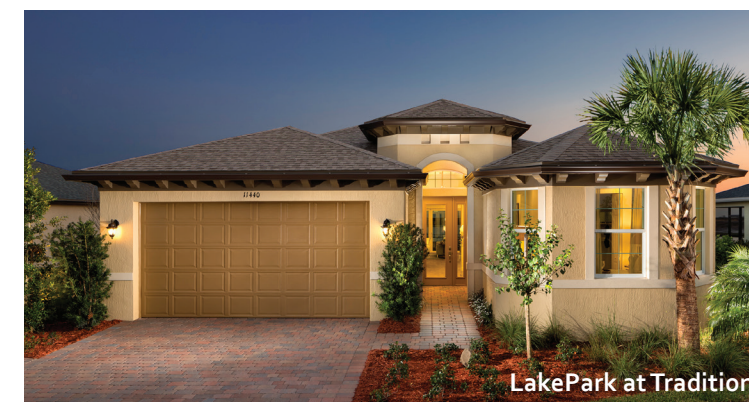
LakePark at Tradition