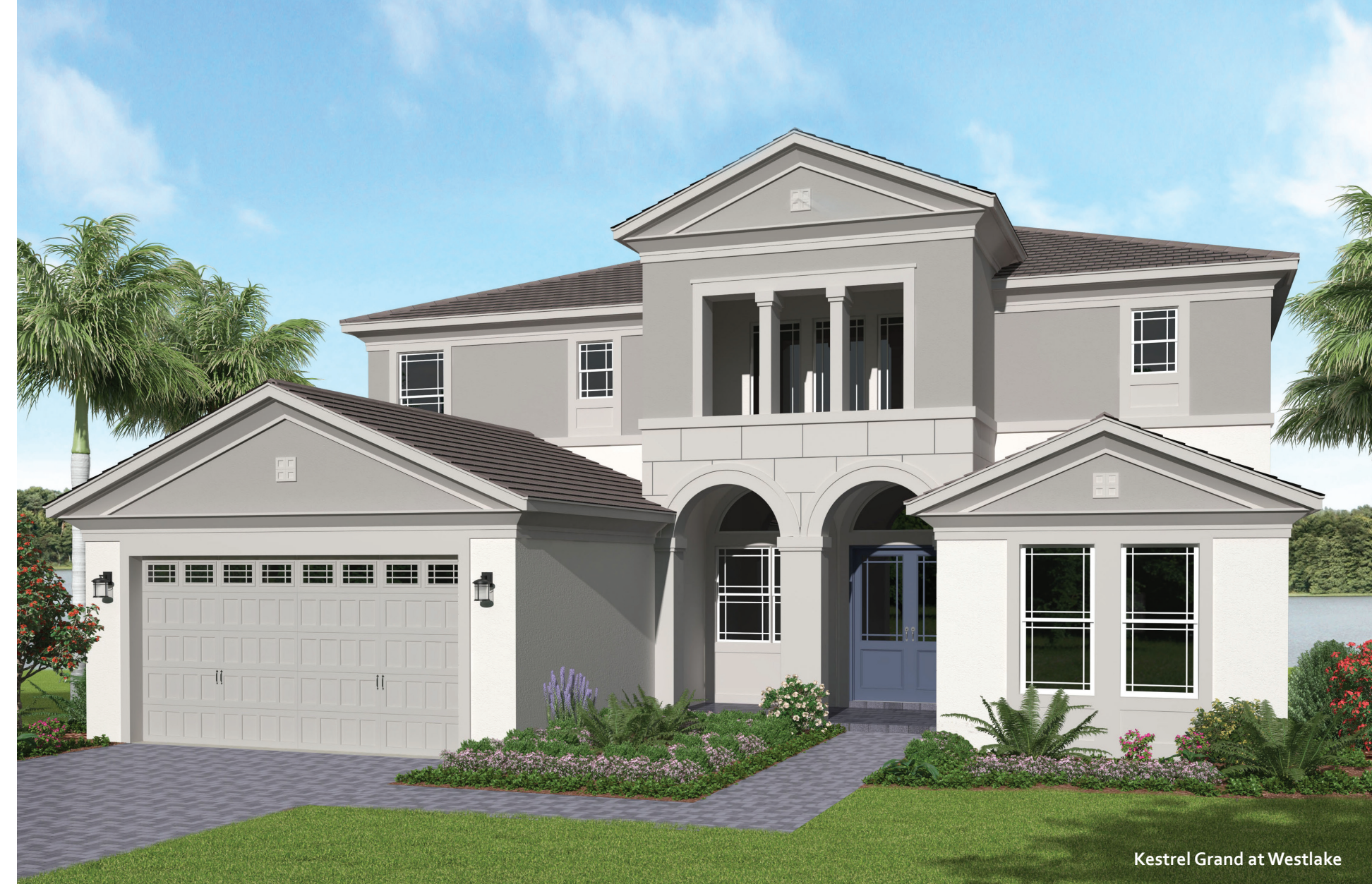
Kestrel Grand at Westlake

Westlake has the Minto home that's right for you. A place to call your own in Florida's new city!