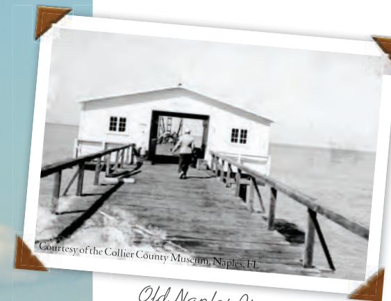
Old Naples Pier