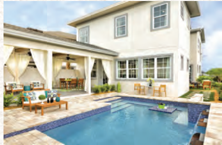
Laureate Park at Lake Nona, Orlando, FL