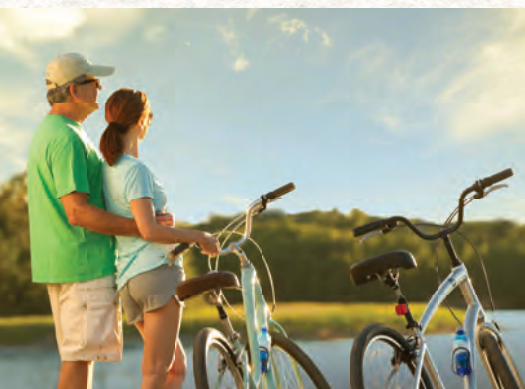
Active outdoor lifestyle

Luxury. Harmony. Discovery. Life unfurls along the waterfront.