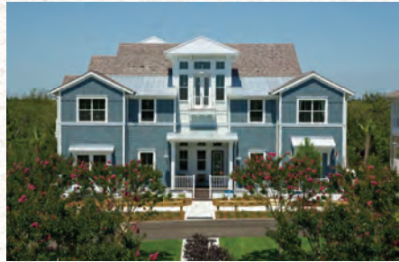
Harbour Isle, Bradenton, FL