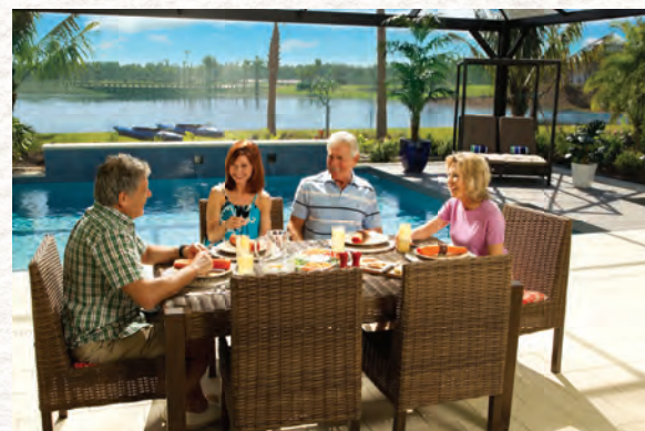
Entertaining with friends

Within the tranquil confines of this private sanctuary, life unfurls along tree-shaded lanes, through ancient stands of cypress, pine and mangrove, and down scenic kayak and hiking trails winding through acres of unspoiled natural habitat.