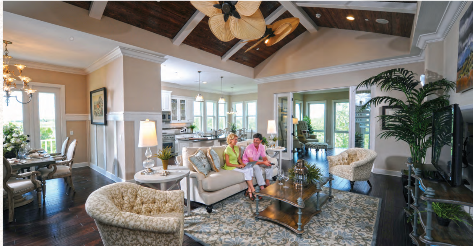
Harbour Isle, Bradenton, FL