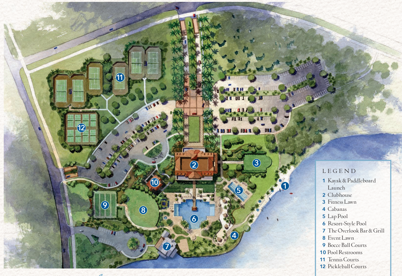
Amenity Site Plan

An elegant sanctuary for everyday living . An extraordinary setting for everyday adventures .