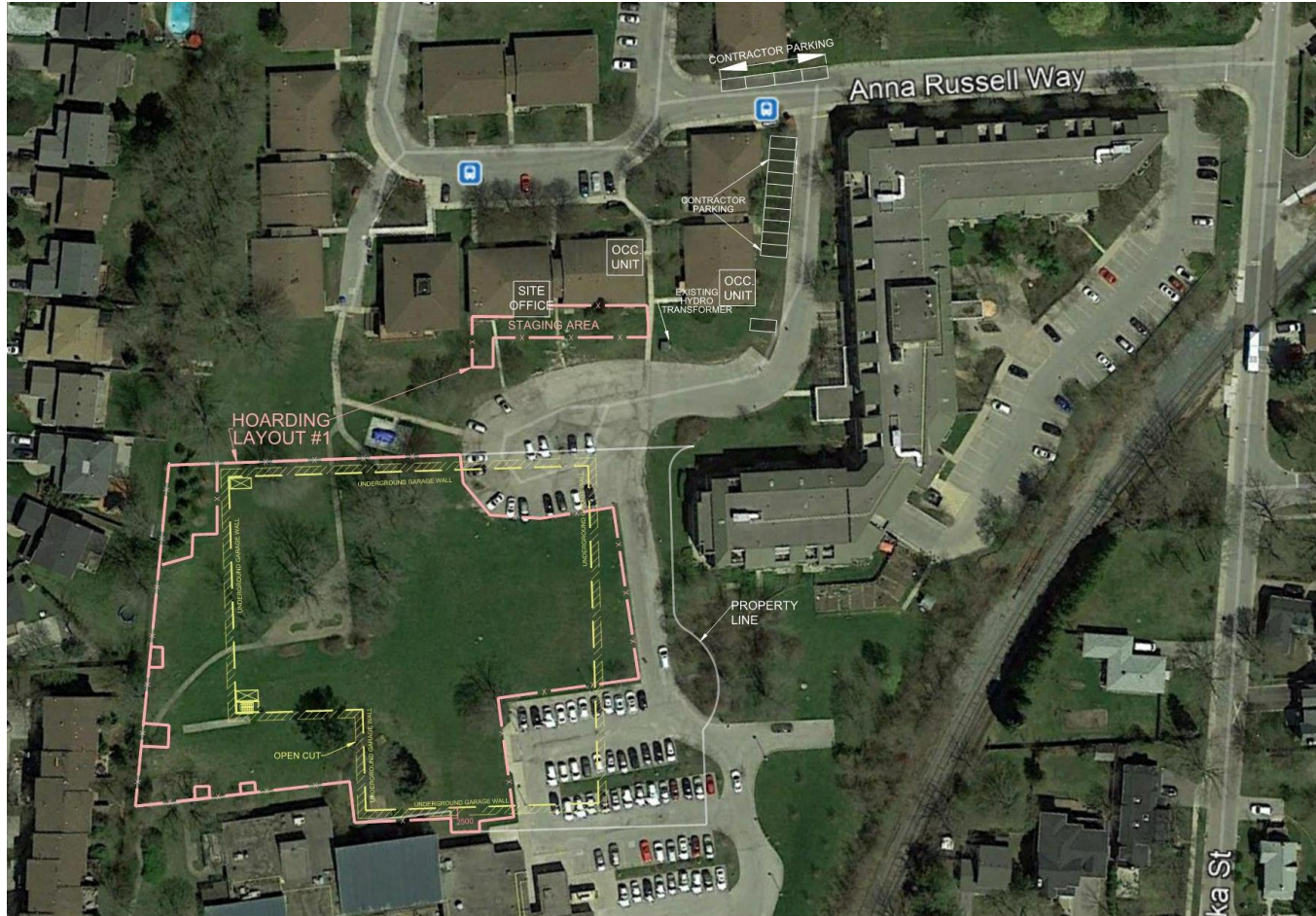
Hoarding Plan - Phase 1