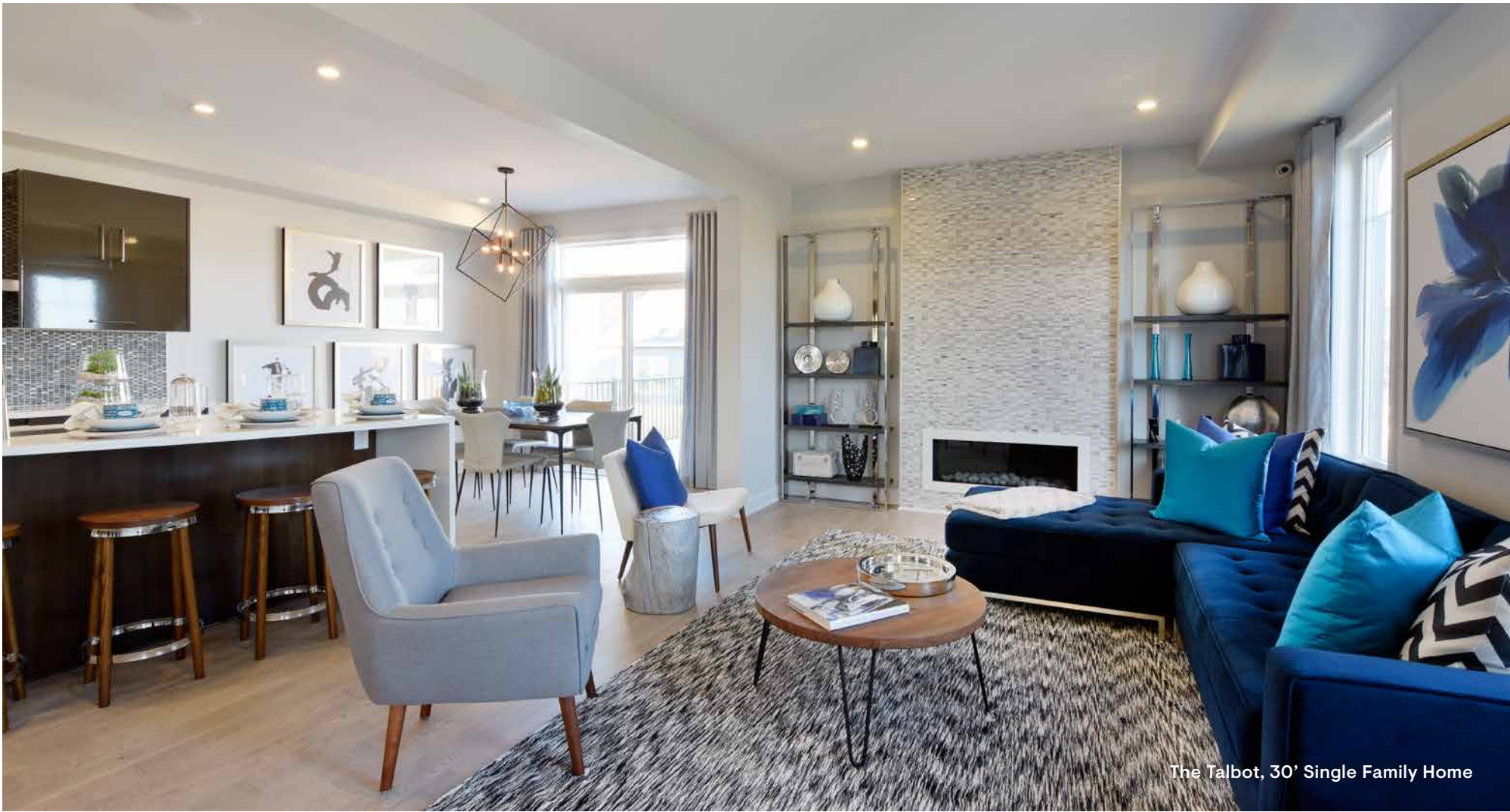
The Talbot, 30' Single Family Home

During your Design Centre appointment(s), you will have an option to change the size of your appliance openings in your kitchen. If you would like to accommodate a larger/wider fridge, a gas stove, slide-in (versus stand-alone) oven, and so on, your Design Centre appointment(s) is the time to make these changes.