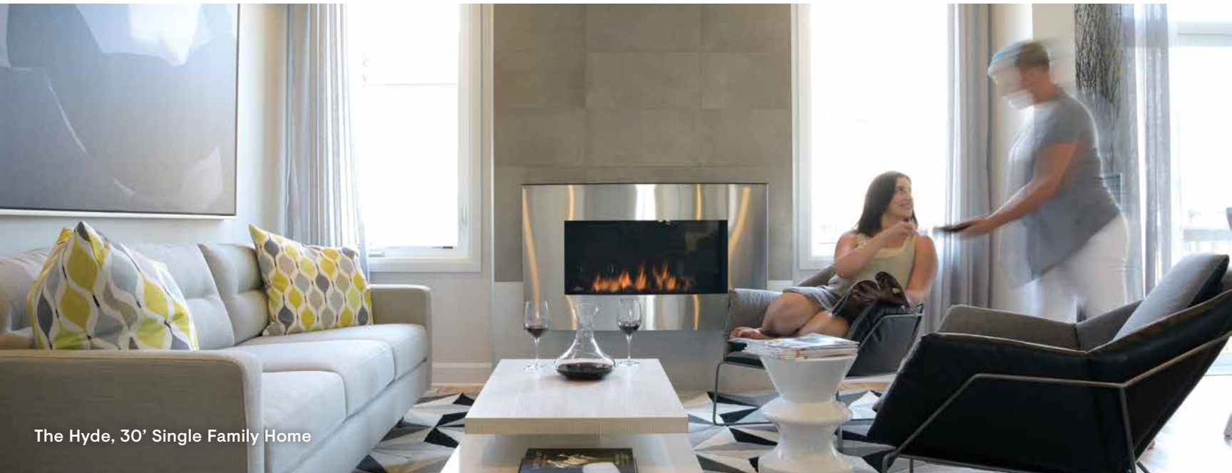
The Hyde, 30' Single Family Home