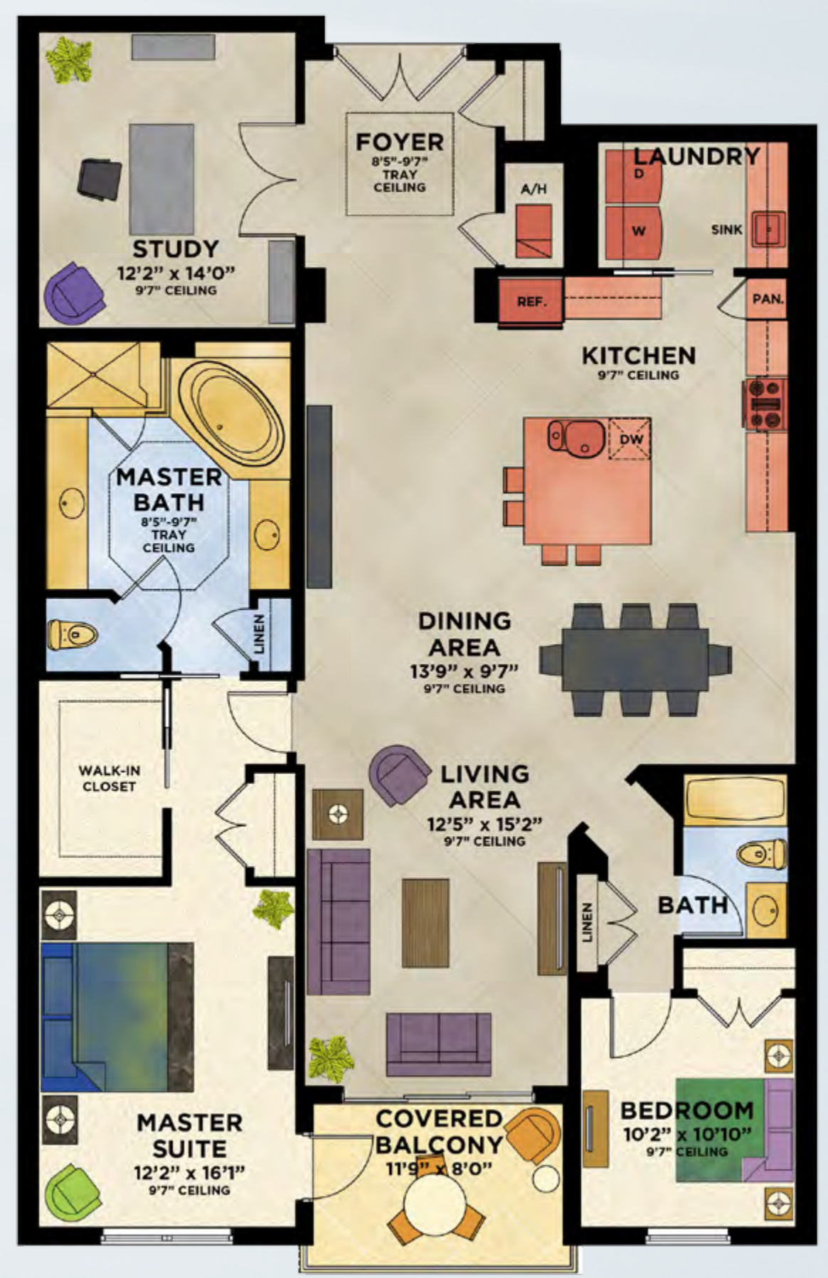
10'4" Ceiling Heights - 4th Floor Only

Standard Floor Plan (w/3rd & 4th Floor Balcony)