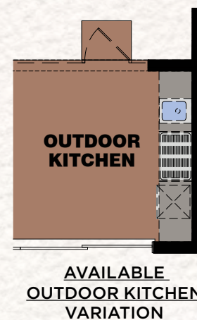
AVAILABLE OUTDOOR KITCHEN VARIATION