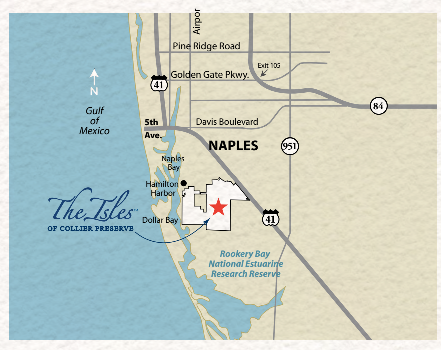
From I-75, take Exit 105 and travel west on Golden Gate Parkway to Airport Pulling Road. Exit to the right, then turn left onto Airport Pulling Road and continue 3 miles to Tamiami Trail East (US41). Turn left and continue 2.5 miles to The Isles of Collier Preserve entrance on the right.