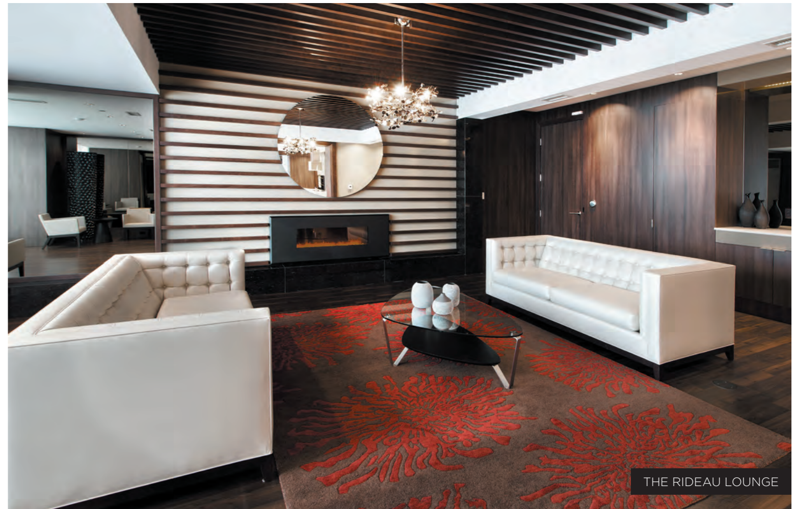
THE RIDEAU LOUNGE