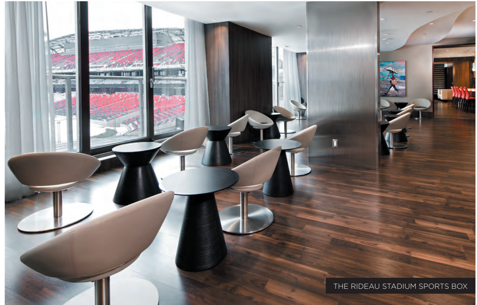
THE RIDEAU STADIUM SPORTS BOX