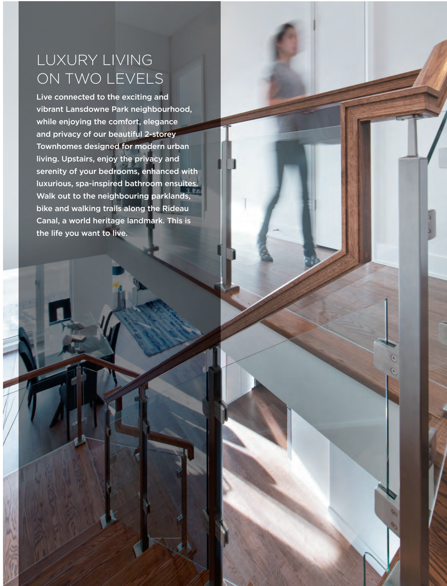
TOWNHOME LIVING ROOM

Live connected to the exciting and vibrant Lansdowne Park neighbourhood, while enjoying the comfort, elegance and privacy of our beautiful 2-storey Townhomes designed for modern urban living. Upstairs, enjoy the privacy and serenity of your bedrooms, enhanced with luxurious, spa-inspired bathroom ensuites. Walk out to the neighbouring parklands, bike and walking trails along the Rideau Canal, a world heritage landmark. This is the life you want to live.