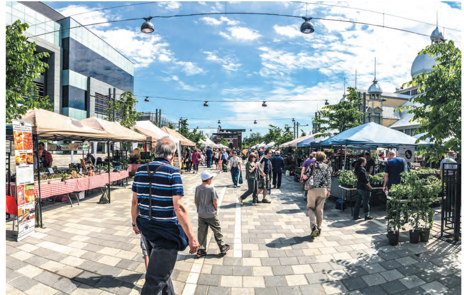
TD PLACE STADIUM